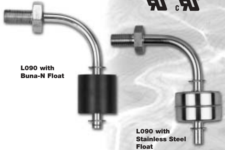
L090 with Buna-N Float